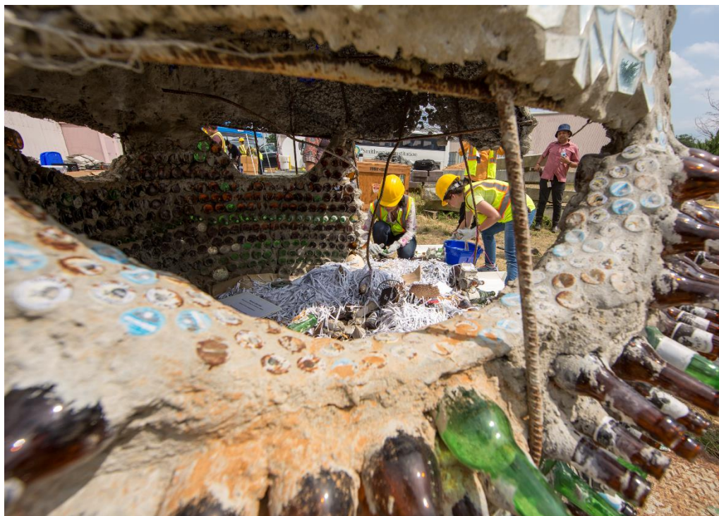
CULTURE CANNOT WAIT!