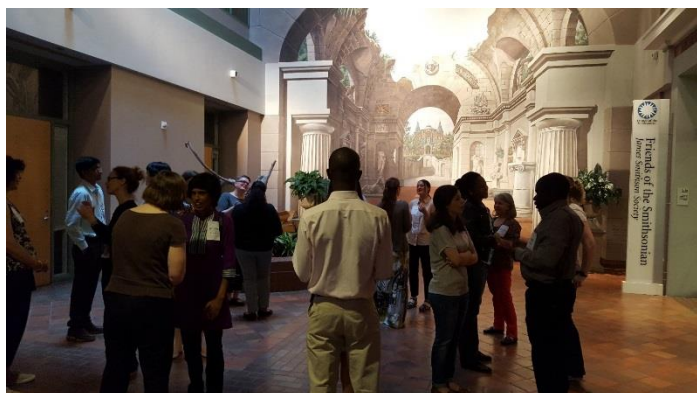
Day 1 - Friday, June 2nd, participants got to know one another in the Ripley Center Quad.