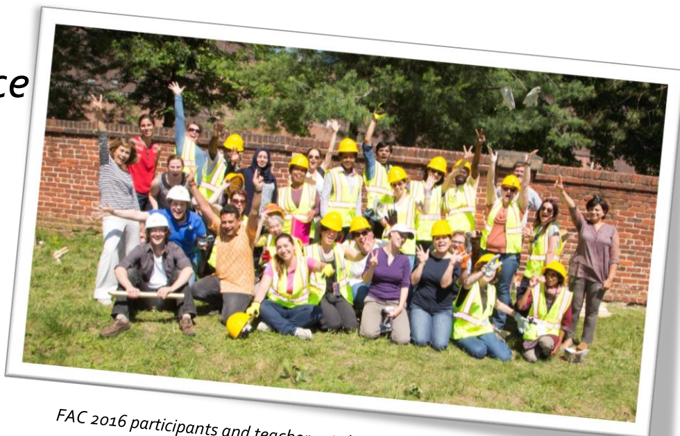
FAC 2016 participants and teachers at the conclusion of our building stabilization sessions!