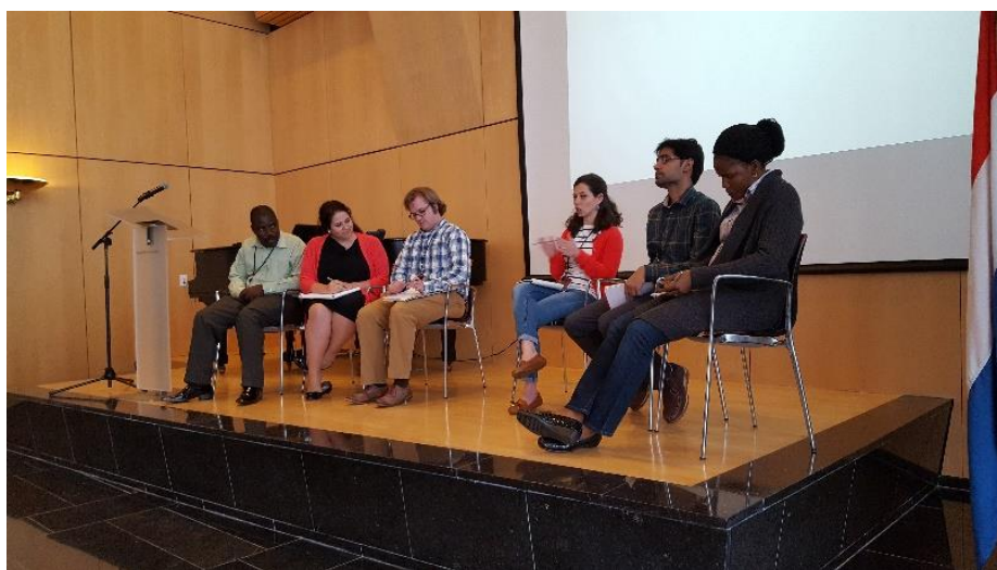
On Saturday, June 4th, the Netherlands Embassy in Washington D.C. hosted part 1 of the participant's conference. The highlight was a debate on the difference between preparing for natural vs. manmade hazards.